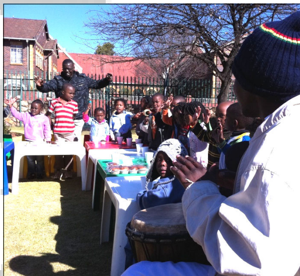
Singing for Mandela: children at a crèche at St Aidans Church have a special tea party to celebrate Madiba's birthday and join millions of others by singing Happy Birthday to him.

Nazareth House had to turn away groups who wanted to come and help - there were too many!