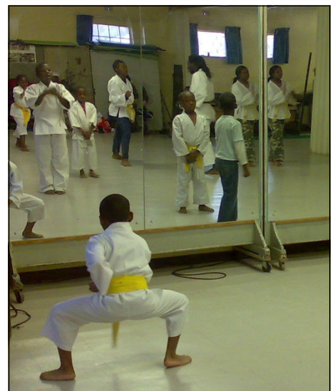
Karate kids: there is a karate school offering classes in the Yeoville Recreation Centre. Contact the Rec Centre office for more details - 011 6489176

Place: St Aidan's Church, Regent St (between Bedford and Cavendish)