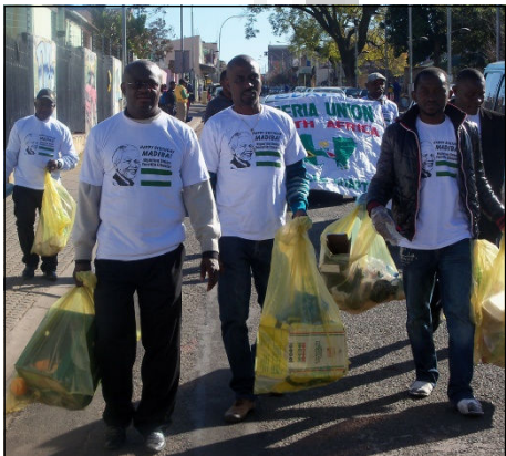
Members of the Nigeria Union spent their 67 minutes on Mandela Day cleaning up the streets of Yeoville Bellevue